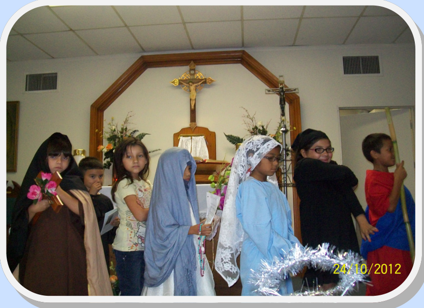
More pictures of the children dressed as Saints

You know that at the end of earth-time, every thing will be stubble. Be sure there is a monument to your earth-love in heaven. Listen to Jesus.